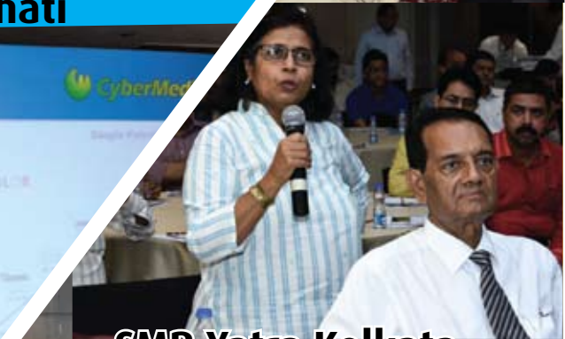
SMB Yatra Kolkata