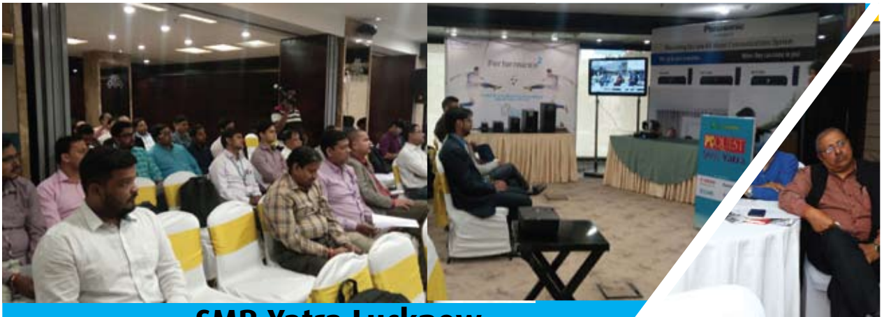
SMB Yatra Lucknow