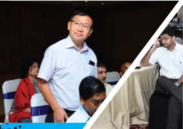
SMB Yatra Guwahati